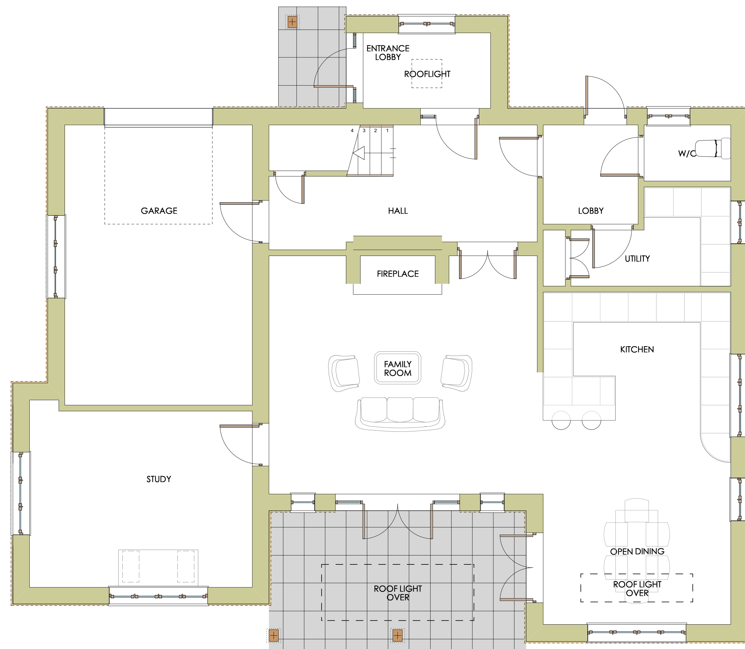
GROUND FLOOR PLAN 1:50 0 1 2 3 4 5 M