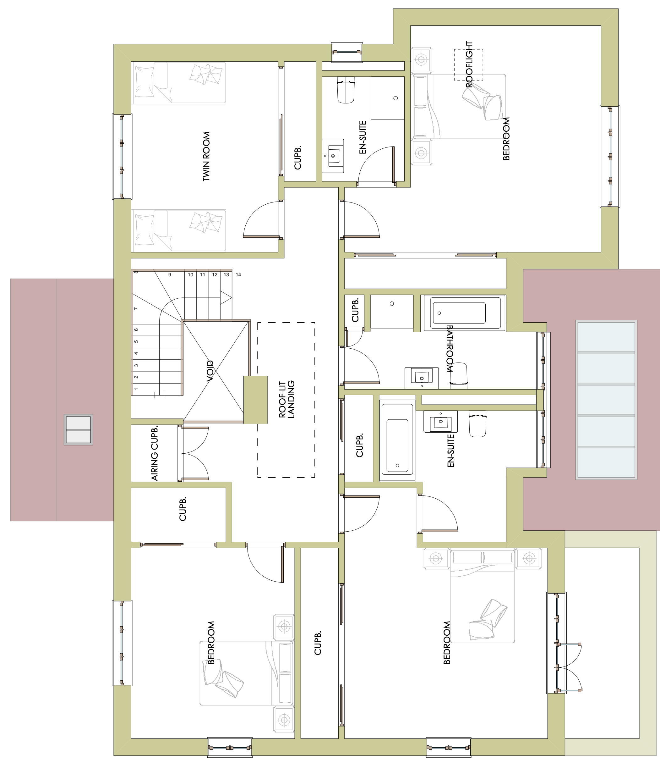
FIRST FLOOR PLAN 1:50