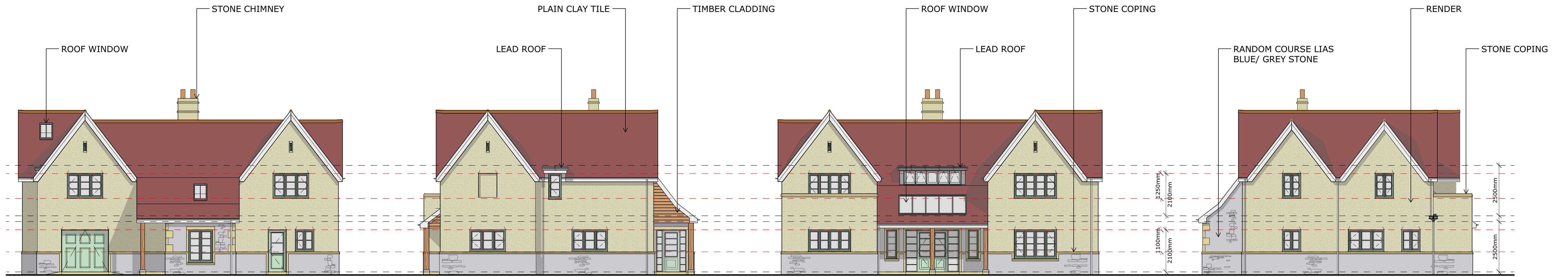
NORTH WEST ELEVATION 1:100